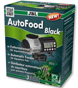
JBL AutoFood BLACK Black automatic feeder for aquarium fish