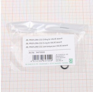
JBL PF CO2 O-ring for VALVE