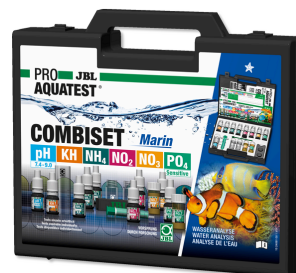
JBL PROAQUATEST COMBISET Marin Test case for water analyses in marine aquariums