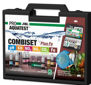
JBL PROAQUATEST COMBISET Plus Fe Test case with most important water tests + iron test