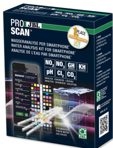
JBL PROSCAN Water test with analysis via smartphone