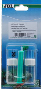
JBL component set for water tests