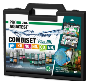
JBL PROAQUATEST COMBISET Plus NH4 Test case with most important water tests + NH4 test