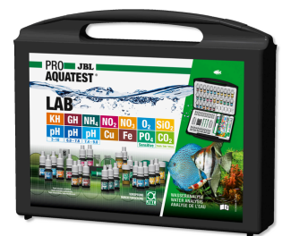
JBL PROAQUATEST LAB Test case with 13 water tests for freshwater analysis