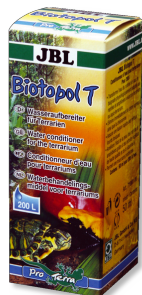
JBL Biotopol T Water conditioner for terrariums