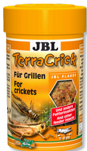
JBL TerraCrick Complete food for feeder insects