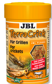
JBL TerraCrick Complete food for feeder insects