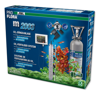
JBL PROFLORA m2003 Plant fertiliser system & 2 kg cylinder & pH control