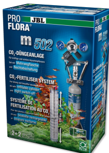
JBL PROFLORA m502 CO2 plant fertiliser system with night switch-off