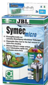
JBL Symec micro Microfibre fleece against water cloudiness