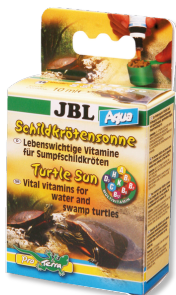
JBL Turtle Sun Aqua Vitamins for turtles and pond terrapins