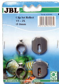
JBL SOLAR REFLECT Clip Set Holder for fluorescent tubes