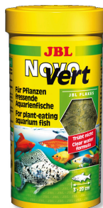
JBL NovoVert Main food flakes for plant-eating fish