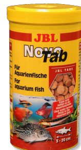
JBL NovoTab Main food tablets for all aquarium fish