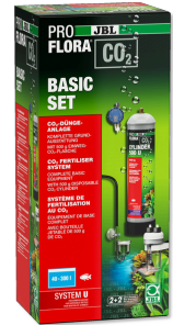
JBL PROFLORA CO2 BASIC SET U CO2 fertil. system basic compl. set f. aquarium plants