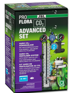
JBL PROFLORA CO2 ADVANCED SET V CO2 system (NO BOTTLE!) with gauges & solenoid valve