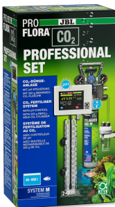
JBL PROFLORA CO2 PROFESSIONAL SET M CO2 plant fertiliser system with CO2 control computer