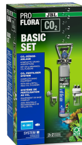
JBL PROFLORA CO2 BASIC SET M CO2 fertil. system basic compl. set f. aquarium plants