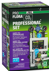
JBL PROFLORA CO2 PROFESSIONAL SET V CO2 plant fertiliser system & CO2 control (NO BOTTLE)