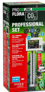
JBL PROFLORA CO2 PROFESSIONAL SET U CO2 plant fertiliser complete set + CO2/pH control