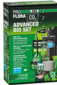
JBL PROFLORA CO2 ADVANCED BIO SET Bio-CO2 fertiliser system for freshw. tanks (40-110 l)