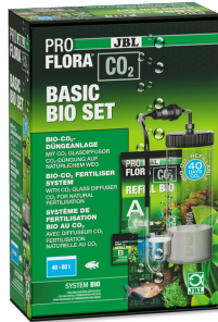
JBL PROFLORA CO2 BASIC BIO SET Bio-CO2 fertiliser system for freshw. tanks (40-80 l)