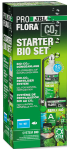
JBL PROFLORA CO2 STARTER BIO SET Bio-CO2 fertiliser system for freshw. tanks (10-40 l)