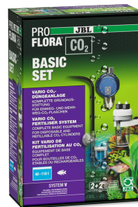
JBL PROFLORA CO2 BASIC SET V CO2 fertiliser system (NO BOTTLE!) for aquarium plants