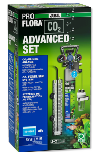
JBL PROFLORA CO2 ADVANCED SET M CO2 plant fertilis. system compl. set+night switch-off