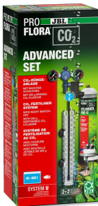
JBL PROFLORA CO2 ADVANCED SET U CO2 plant fertil. system compl. set + night switch-off