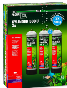
JBL PROFLORA CO2 CYLINDER 500 U 3x 500g disposable CO2 storage cylinder (value pack of 3)