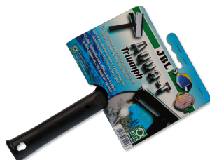
JBL Aqua-T Triumph Glass pane cleaner with spare blades and rubber scraper