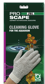
JBL PROSCAPE CLEANING GLOVE Aquarium cleaning glove