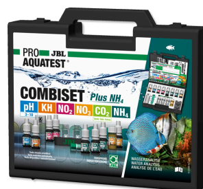
JBL PROAQUATEST COMBISET Plus NH4 Test case with most important water tests + NH4 test