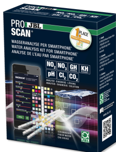
JBL PROSCAN Water test with analysis via smartphone