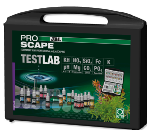
JBL PROAQUATEST LAB PROSCAPE Test case for water analysis in plant aquariums