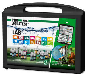
JBL PROAQUATEST LAB Test case with 13 water tests for freshwater analysis