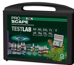
JBL PROAQUATEST LAB PROSCAPE Test case for water analysis in plant aquariums