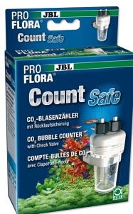
JBL PROFLORA CO2 Count Safe