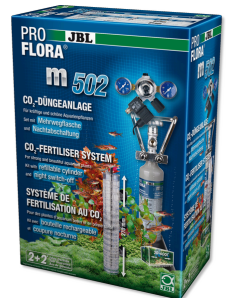
JBL PROFLORA m502 CO2 plant fertiliser system with night switch-off