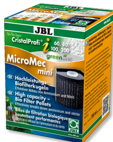
JBL MicroMec CristalProfi i60/80/100/200 High-performance filter balls for CristalProfi i