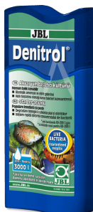
JBL Denitrol Bacteria starter for adding aquarium fish