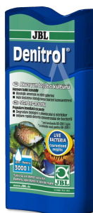
JBL Denitrol Bacteria starter for adding aquarium fish