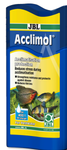
JBL Acclimol Water conditioner for acclimatisation