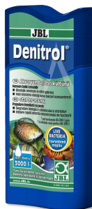
JBL Denitrol Bacteria starter for adding aquarium fish