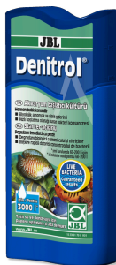
JBL Denitrol Bacteria starter for adding aquarium fish