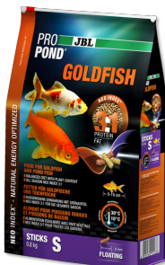
JBL PRO POND GOLDFISH S Food sticks for small goldfish