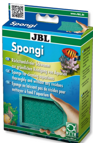
JBL Spongi Cleaning sponge for aquariums and terrariums