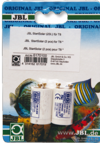
JBL Start Solar Starter for T8 fluorescent tubes