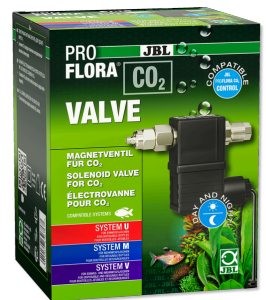
JBL PROFLORA CO2 VALVE CO2 solenoid valve for regulated CO2 addition