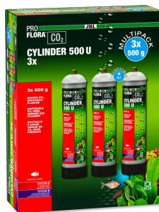
JBL PROFLORA CO2 CYLINDER 500 U 3x 500g disposable CO2 storage cylinder (value pack of 3)