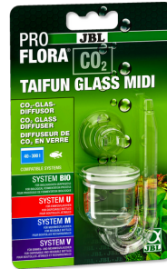
JBL PROFLORA CO2 TAIFUN GLASS Glass CO2 diffuser for freshwater tanks from 40-300 l