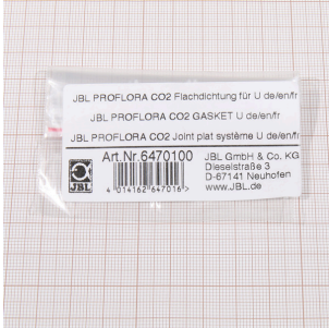
JBL PF CO2 flat gasket for u