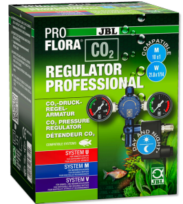
JBL PROFLORA CO2 REGULATOR PROFESSIONAL Pressure regulator with 2 displays & valve for CO2