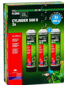
JBL PROFLORA CO2 CYLINDER 500 U 3x 500g disposable CO2 storage cylinder (value pack of 3)