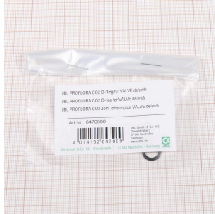
JBL PF CO2 O-ring for VALVE