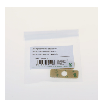
JBL DigiScan Velcro Pad, 2x