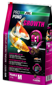
JBL PROPOND GROWTH M