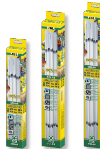
JBL SOLAR Reflect T5/ T8 - 895-1500 mm Reflector panel for fluorescent tube