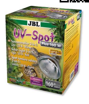
JBL UV-Spot plus UV spotlight with daylight spectrum for terrariums