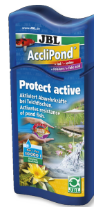
JBL AccliPond Water conditioner for ponds