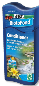
JBL BiotoPond Water conditioner for ponds