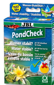
JBL PondCheck Quick test to determine the pH and KH values