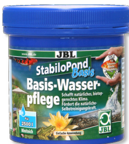
JBL StabiloPond Basis Basic care product for all garden ponds