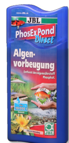
JBL PhosEX Pond Direct Phosphate remover for ponds