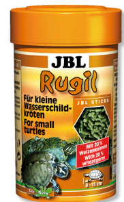
JBL Rugil Food sticks for small turtles