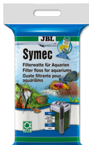
JBL Symec Filter floss Filter wool to remove all types of cloudiness