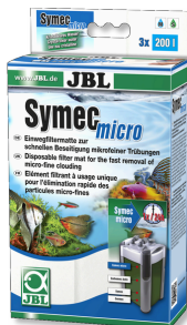
JBL Symec micro Microfibre fleece against water cloudiness