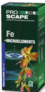
JBL PROSCAPE Fe + MICROELEMENTS Basic plant fertiliser for aquascaping