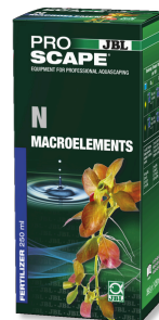
JBL PROSCAPE N MACROELEMENTS Nitrogen plant fertiliser for aquascaping