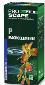
JBL PROSCAPE P MACROELEMENTS Phosphorus plant fertiliser for aquascaping