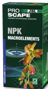
JBL PROSCAPE NPK MACROELEMENTS 3-component plant fertiliser for aquascaping