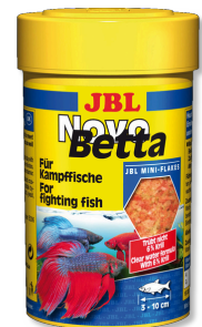
JBL NovoBetta Complete food for labyrinth fish, e.g. fighting fish