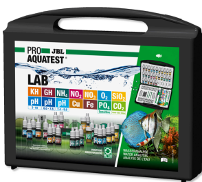
JBL PROAQUATEST LAB Test case with 13 water tests for freshwater analysis