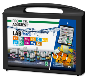
JBL PROAQUATEST LAB Marin Professional test case for marine water analysis