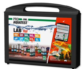
JBL PROAQUATEST LAB Koi Professional test case for koi and garden ponds