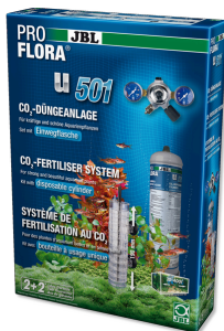
JBL PROFLORA u501 Plant fertiliser system complete kit