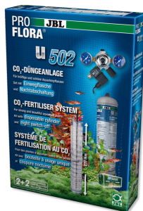
JBL PROFLORA u502 Plant fertiliser system with night switch-off