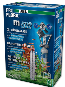
JBL PROFLORA m502 CO2 plant fertiliser system with night switch-off