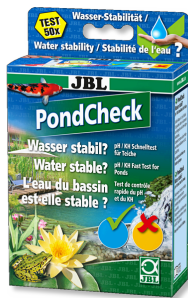
JBL PondCheck Quick test to determine the pH and KH values