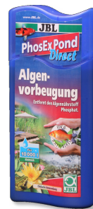
JBL PhosEX Pond Direct Phosphate remover for ponds