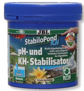
JBL StabiloPond KH pH balancer for garden ponds