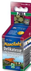
JBL NanoTabs Main food for shrimp and dwarf crayfish