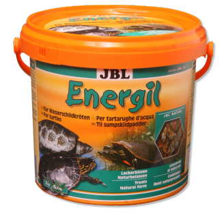
JBL Energil Main food for turtles and pond terrapins