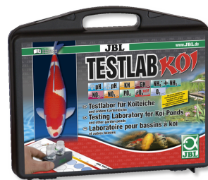
JBL Testlab Koi Professional test case for koi and garden ponds