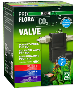
JBL PROFLORA CO2 VALVE CO2 solenoid valve for regulated CO2 addition