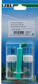
JBL component set for water tests