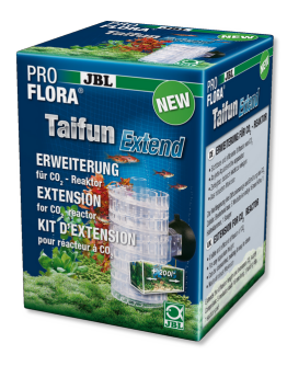
JBL PROFLORA Taifun Extend

Extension for CO2 high-performance diffuser