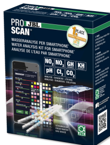
JBL PROSCAN Water test with analysis via smartphone