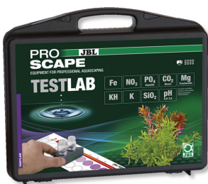
JBL Testlab ProScope Test case for water analysis in plant aquariums