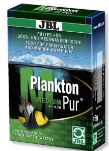
JBL Plankton Pur MEDIUM Treats for large aquarium fish