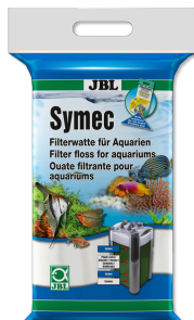
JBL Symec Filter floss Filter wool to remove all types of cloudiness