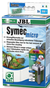
JBL Symec micro Microfibre fleece against water cloudiness