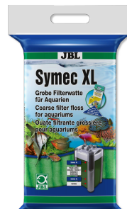
JBL Symec XL Coarse filter wool to remove all types of water cloudiness