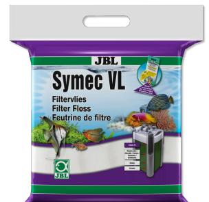
JBL Symec VL Filter wool fleece to remove water cloudiness